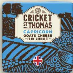
Cricket St Thomas Goats Cheese 1.1kg