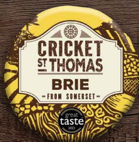
Cricket St Thomas Brie 1.1kg