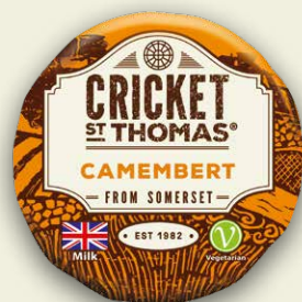
Cricket St Thomas Camembert 220g